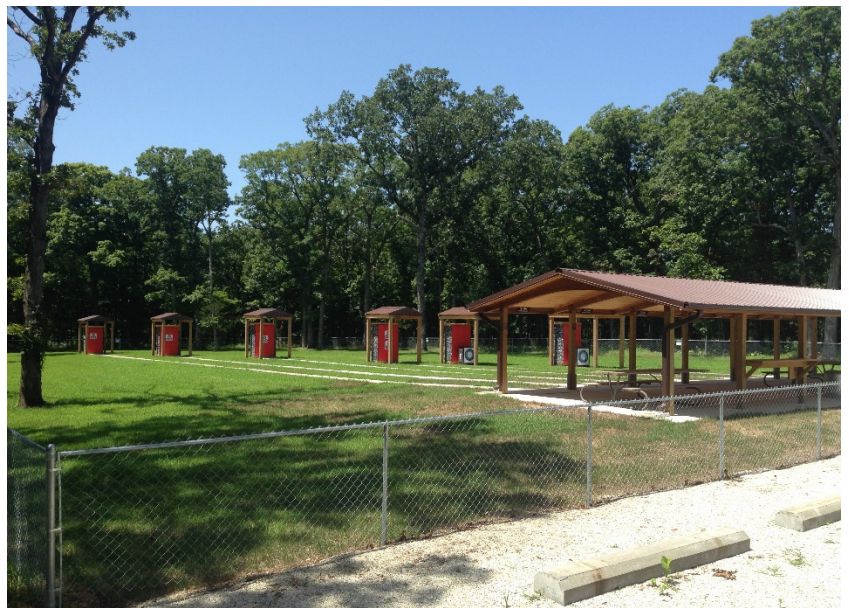
Archery Range – August 2016

The archery range is located near the Project Office on the east side of the dam. It features a covered shooting house with handicap accessible lanes leading to 6 targets. The first four targets are placed at distances of 20, 30, 40 & 50 yards. The last two targets are placed at 10 & 15 meters for schools/students that participate in the National Archery in the Schools Program. The range is free to the public and available on a first come, first served basis.