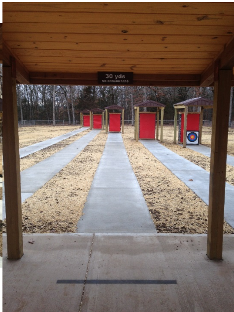
Targets in place and grass seed covered with straw.