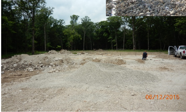
Removal of Trees and Site Leveling