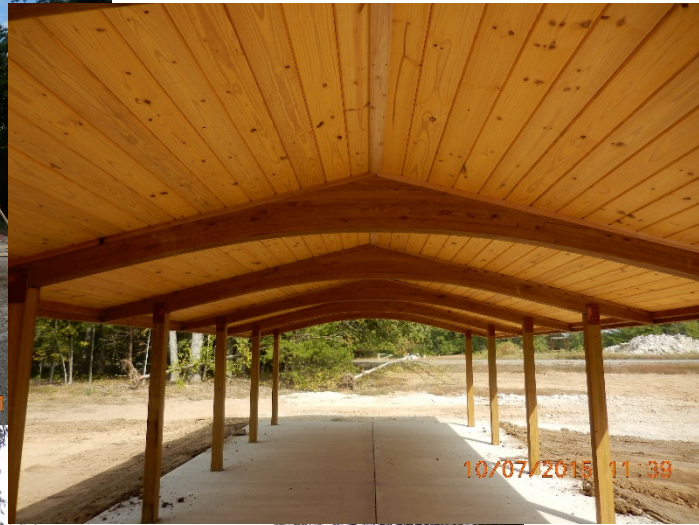
Constructing the Shooting House