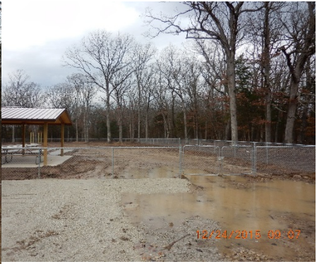
Pouring shooting lanes, building target houses and installing fence