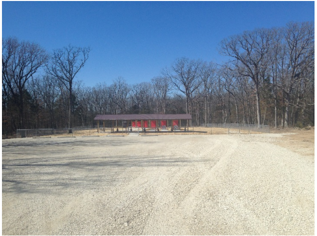
Archery Range and Parking area are completed. 4-H club at Grand Opening on April 2, 2016.